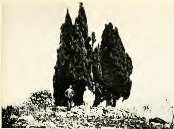
CLUMP OF CYPRESS TREES NEAR THE TOMB OF EAB WITHIN THE SHADE OF WHICH THE BAHÁ'Í O'LLAH USED TO SIT